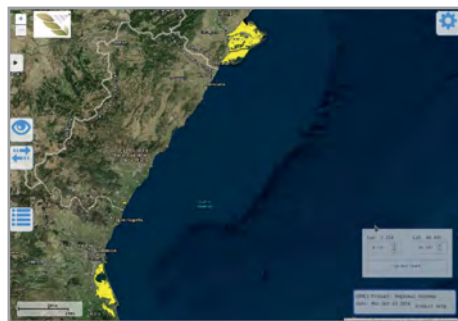
ERMES regional geoportal interface showing the rice map for the Spanish Mediterranean area. Users get access to a variety of products from crop monitoring from the eye icon on the left side.

Our focus was on developing a platform able to create, manage and disseminate NRT spatialised maps derived from the integration of remote sensing images, weather data and crop modelling solutions. We used free-of-